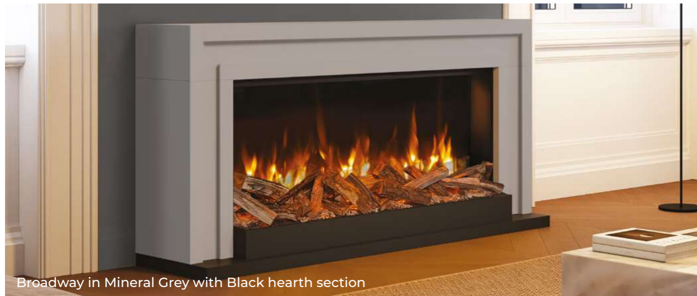
Broadway in Mineral Grey with Black hearth section