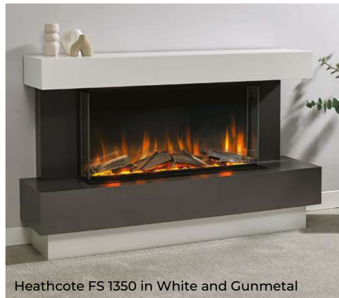
Heathcote FS 1350 in White and Gunmetal