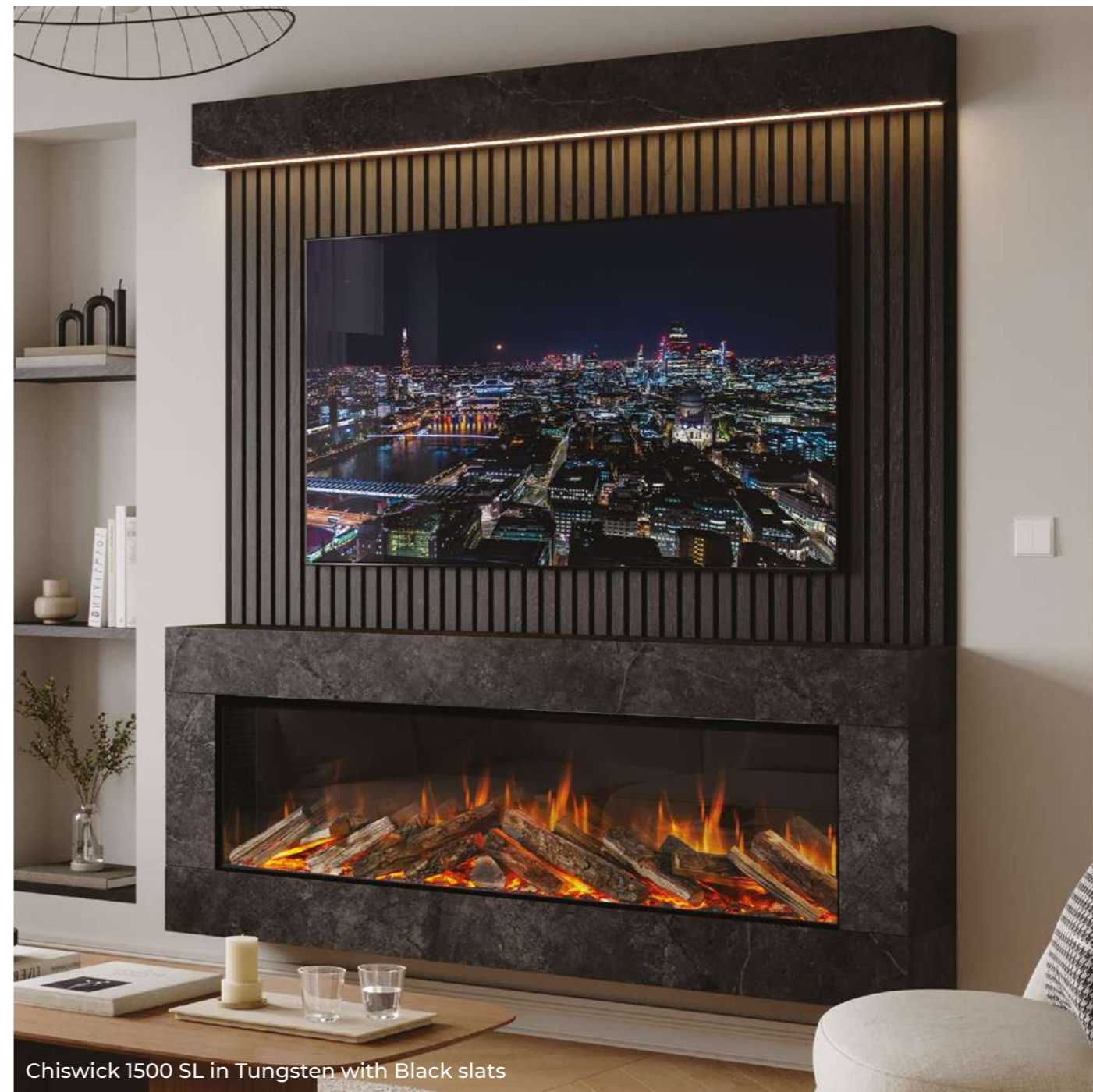
Chiswick 1500 SL in Tungsten with Black slats