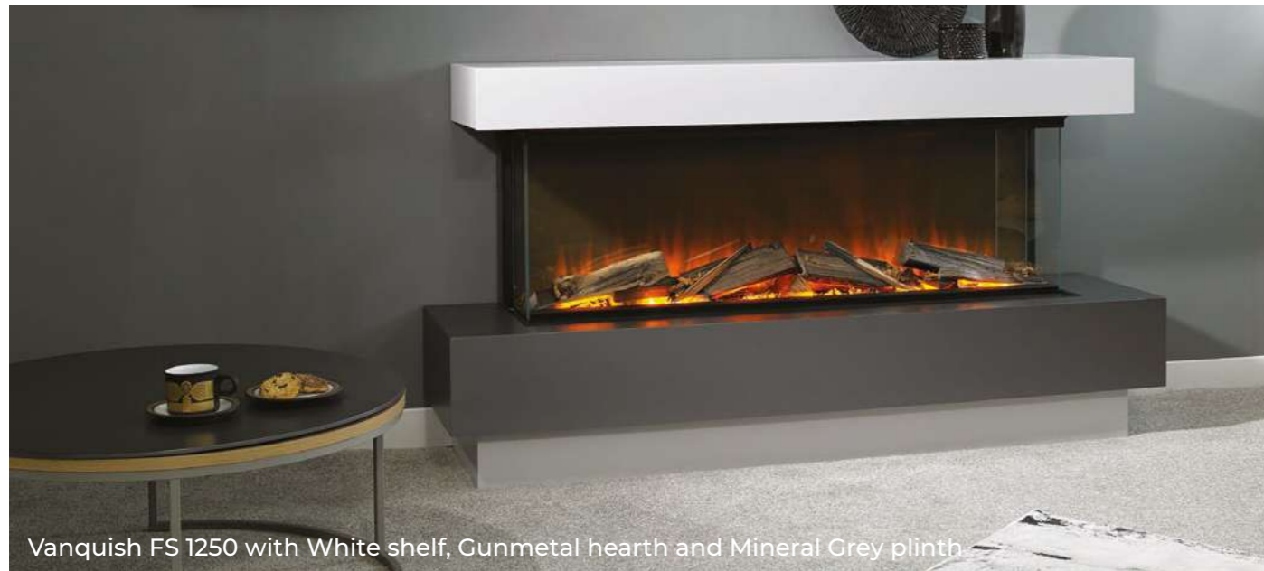
Vanquish FS 1250 with White shelf, Gunmetal hearth and Mineral Grey plinth