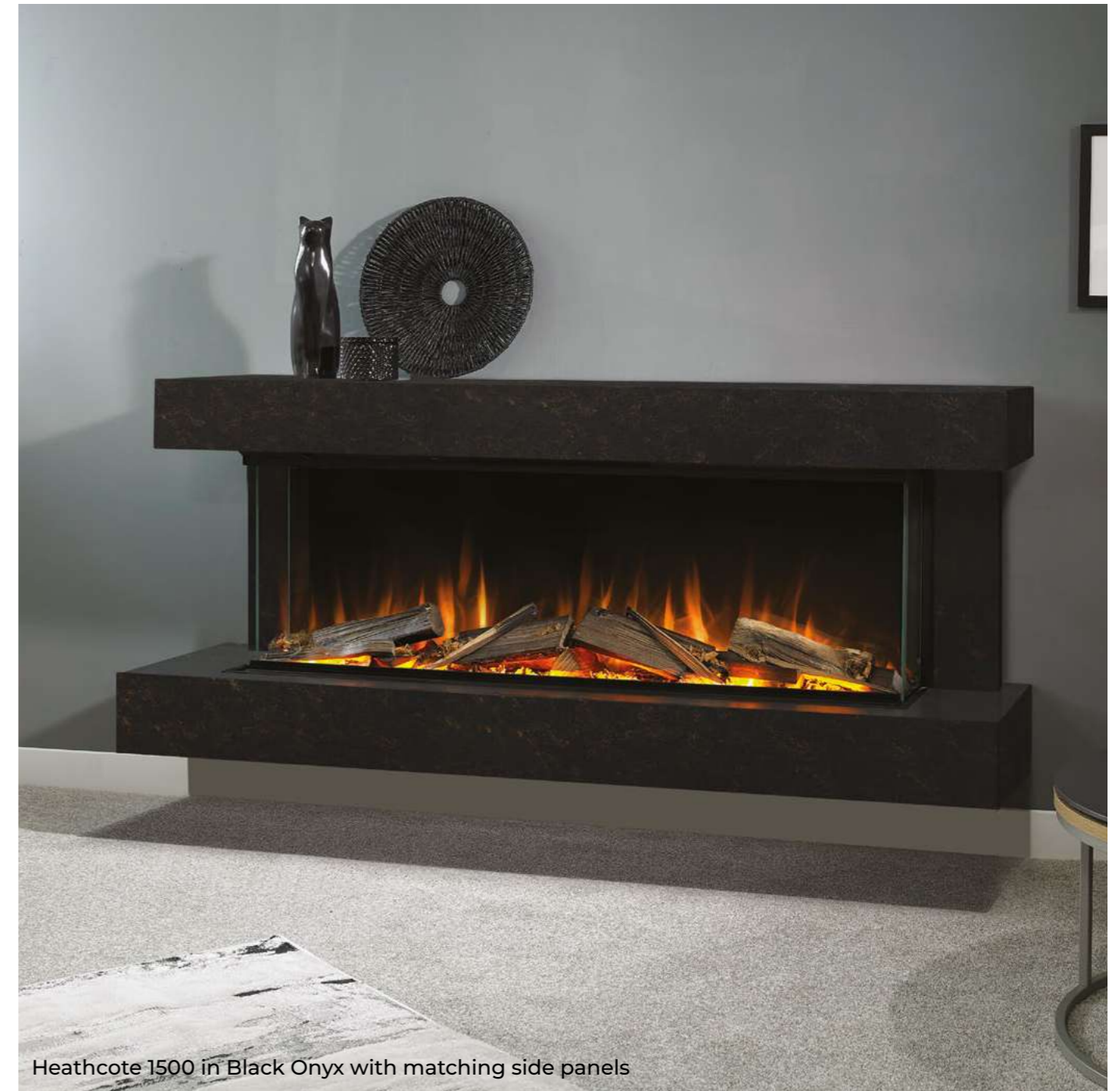
Heathcote 1500 in Black Onyx with matching side panels