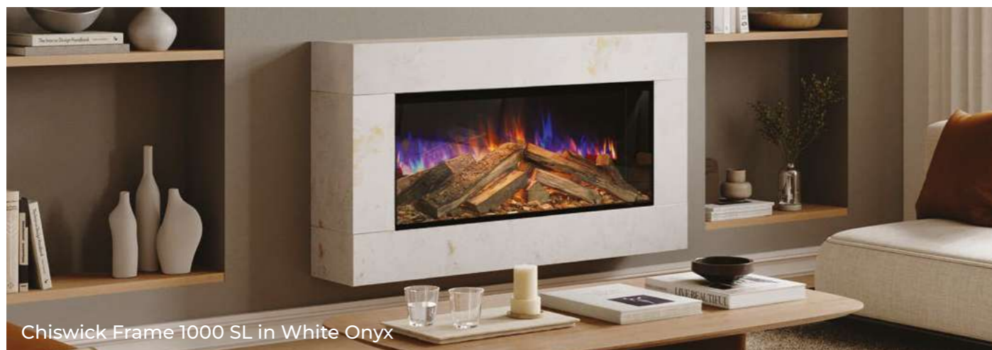
Chiswick Frame 1000 SL in White Onyx