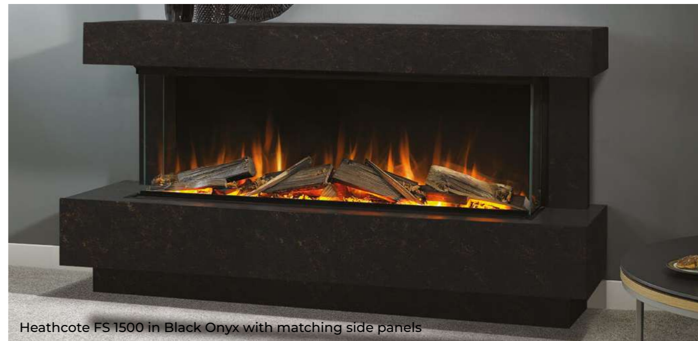
Heathcote FS 1500 in Black Onyx with matching side panels