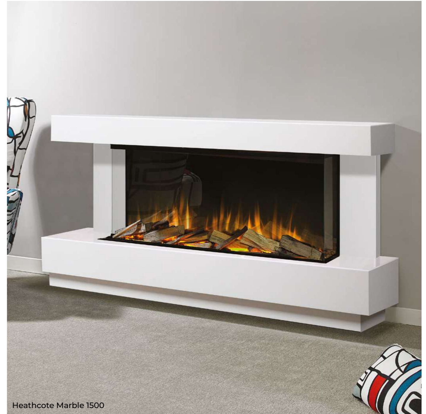
Heathcote Marble 1500