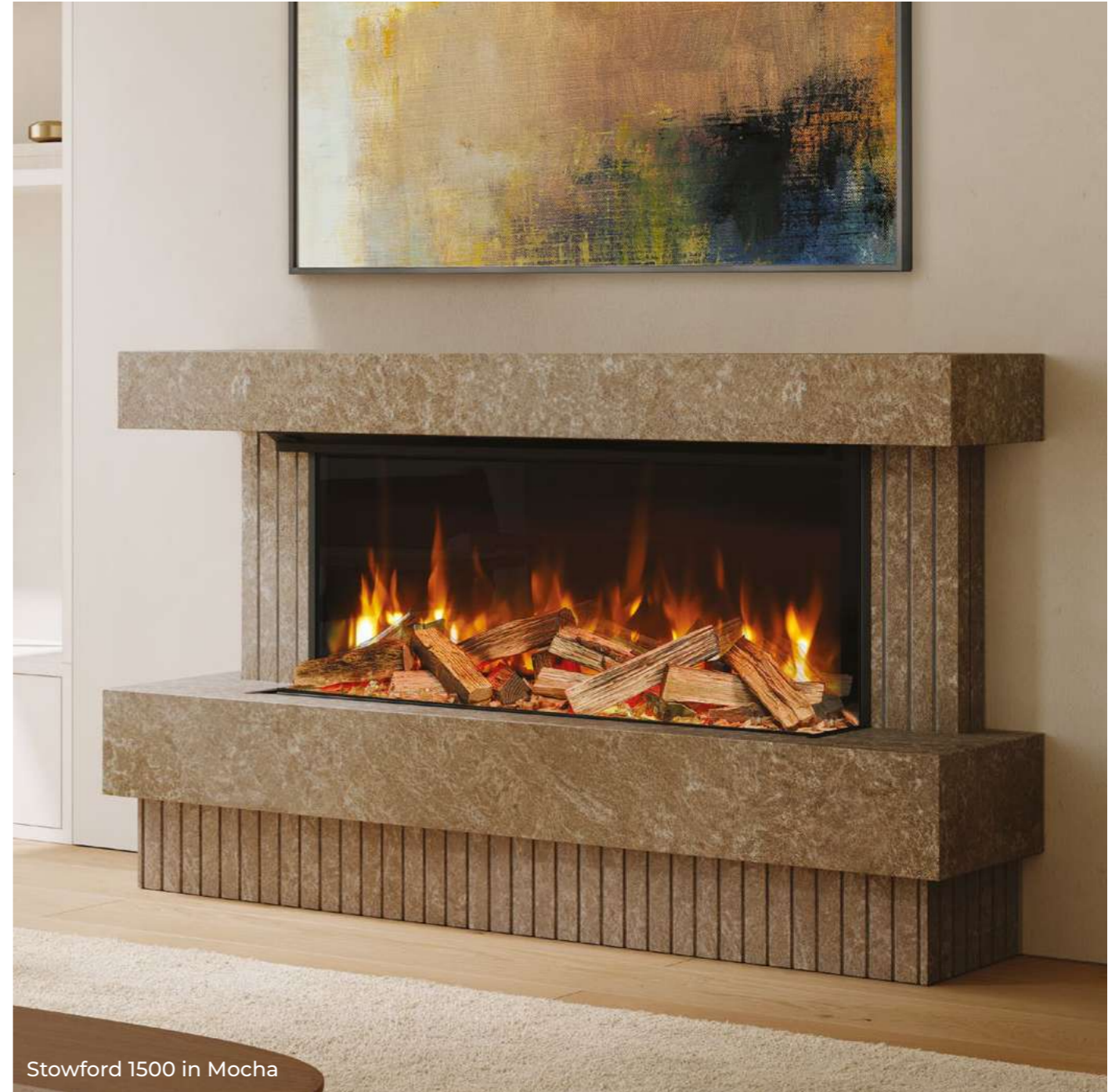
Stowford 1500 in Mocha