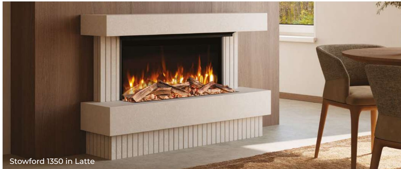
Stowford 1350 in Latte