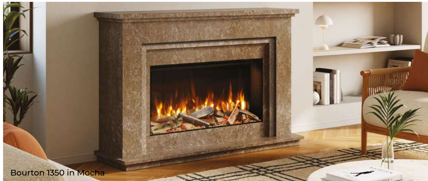
Bourton 1350 in Mocha