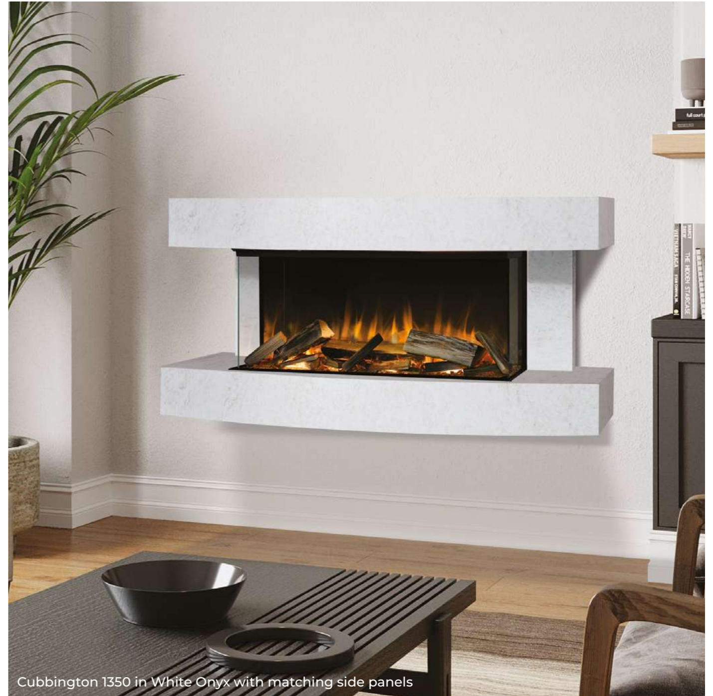
Cubbington 1350 in White Onyx with matching side panels