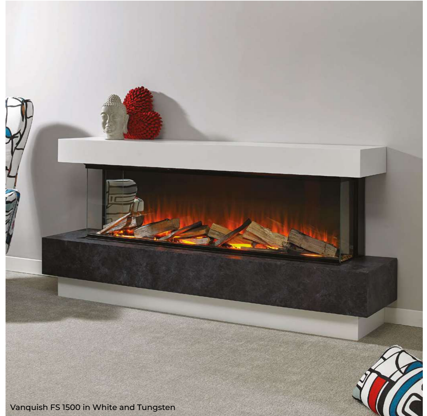
Vanquish FS 1500 in White and Tungsten