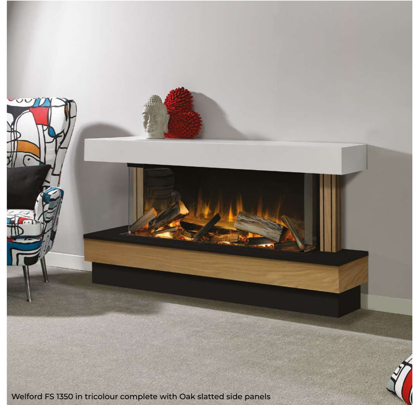
Welford FS 1350 in tricolour complete with Oak slatted side panels