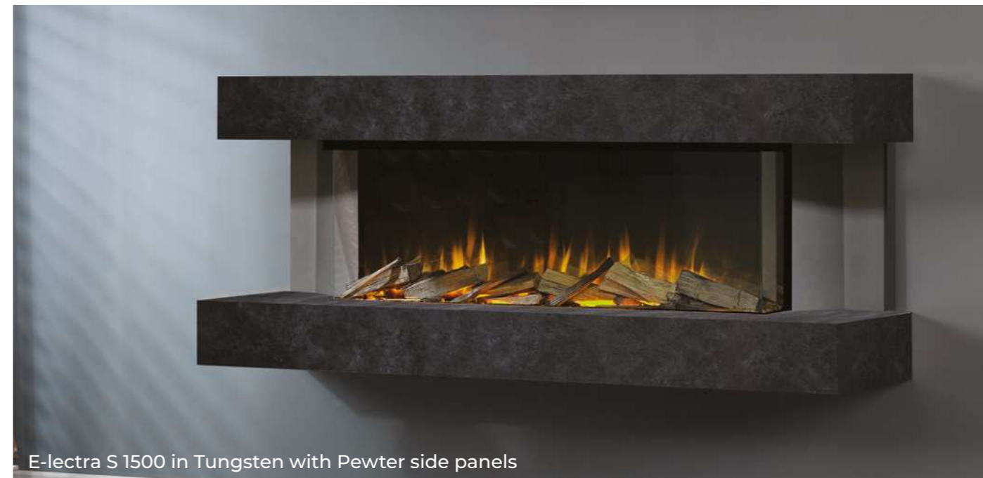
E-lectra S 1500 in Tungsten with Pewter side panels