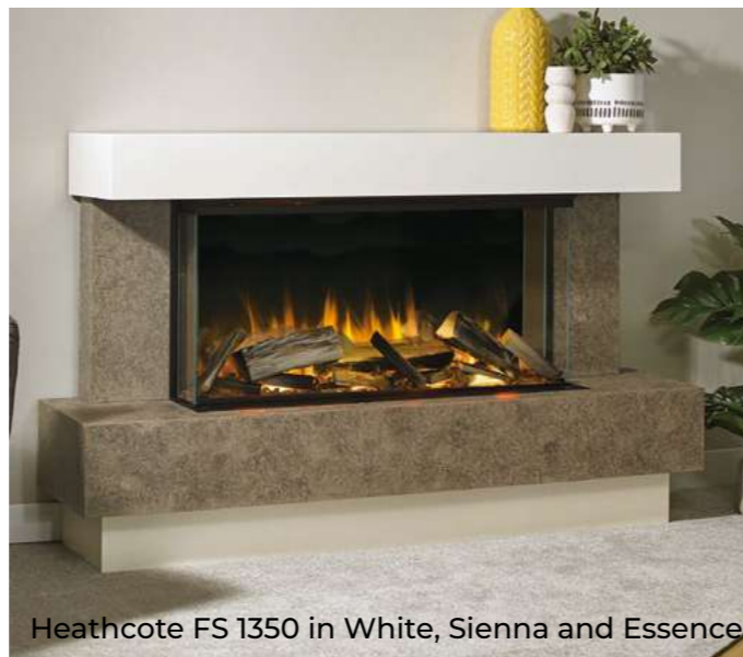
Heathcote FS 1350 in White, Sienna and Essence