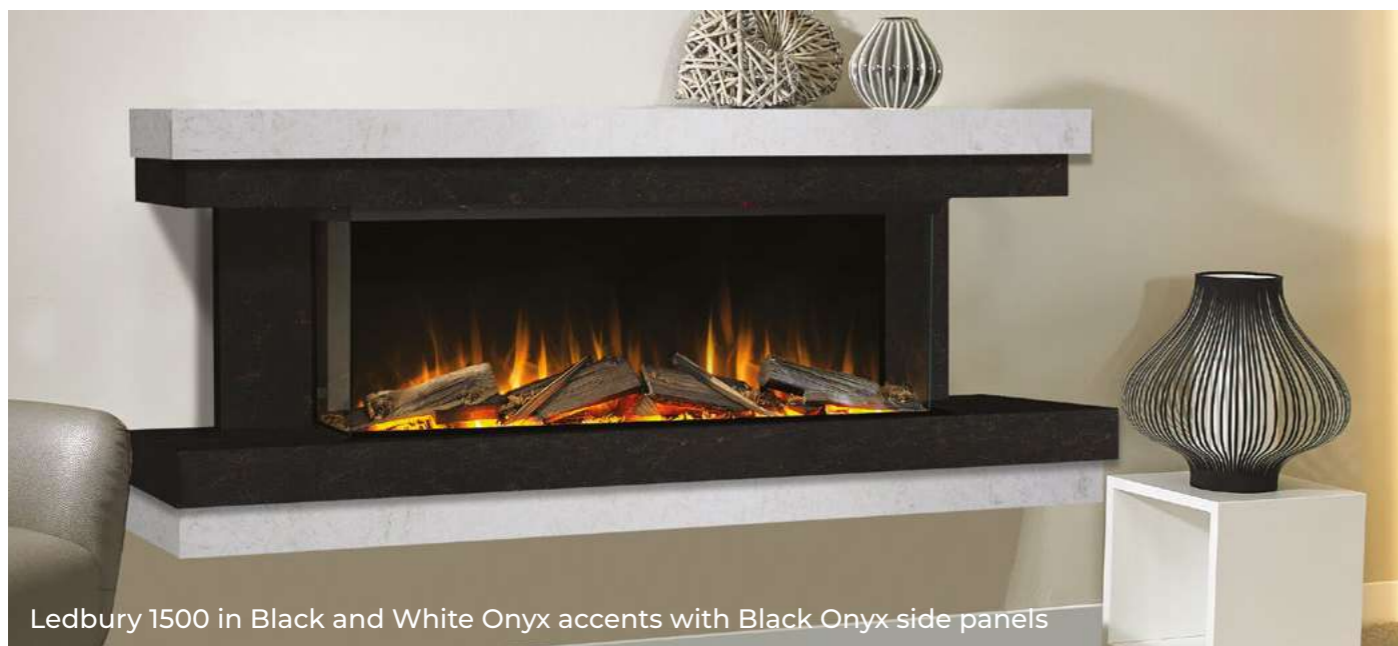
Ledbury 1500 in Black and White Onyx accents with Black Onyx side panels