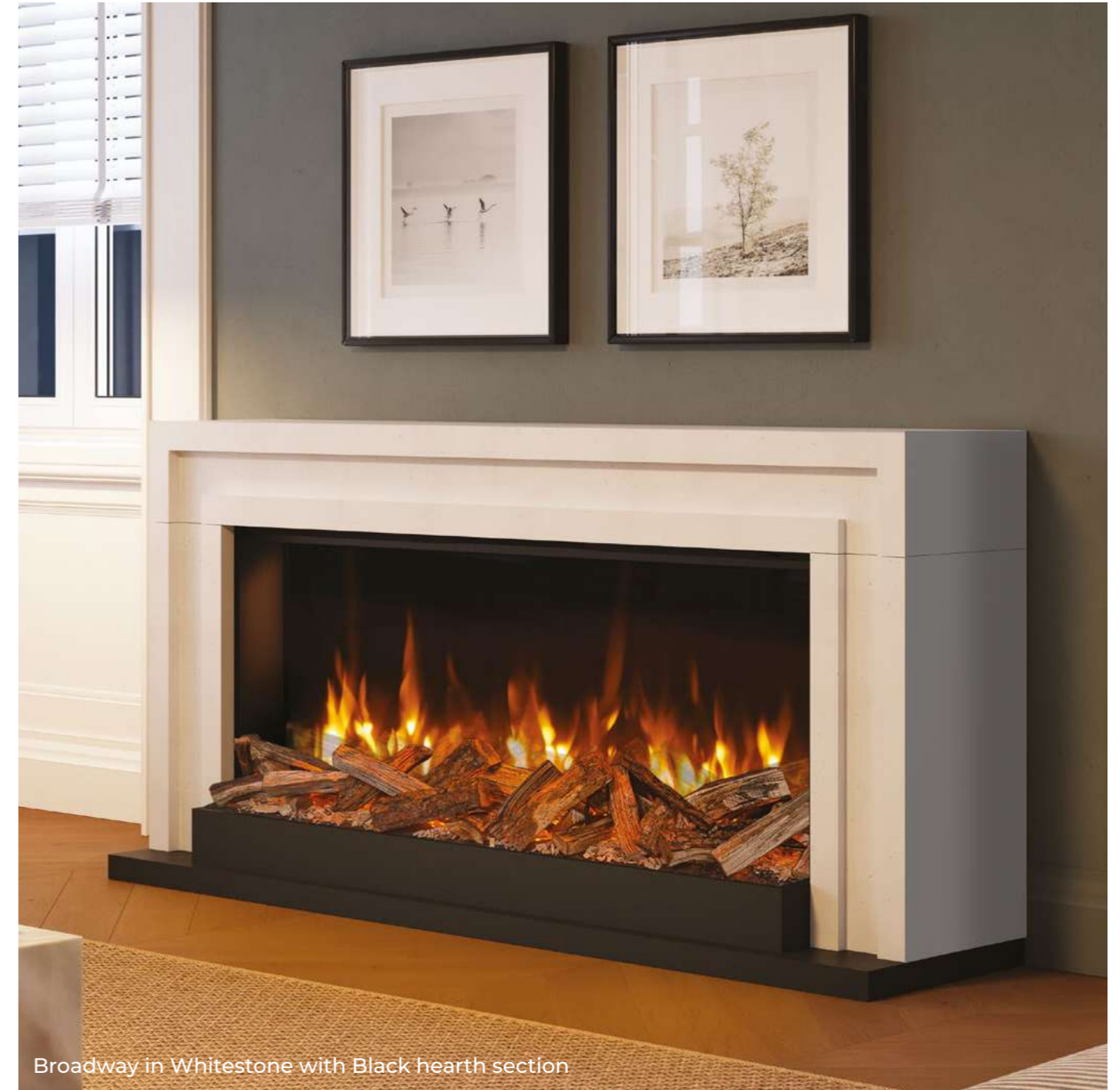
Broadway in Whitestone with Black hearth section