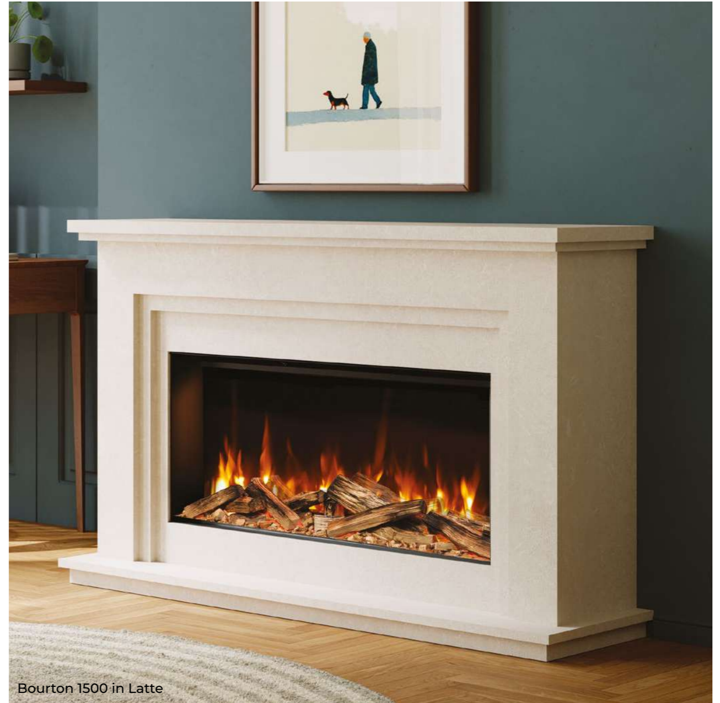
Bourton 1500 in Latte