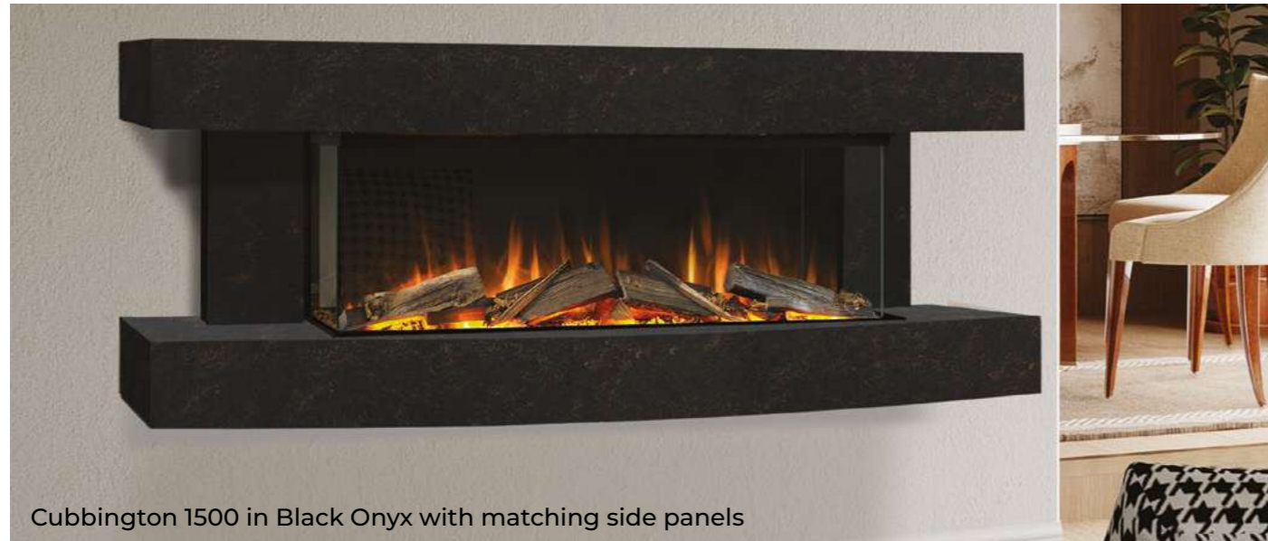
Cubbington 1500 in Black Onyx with matching side panels