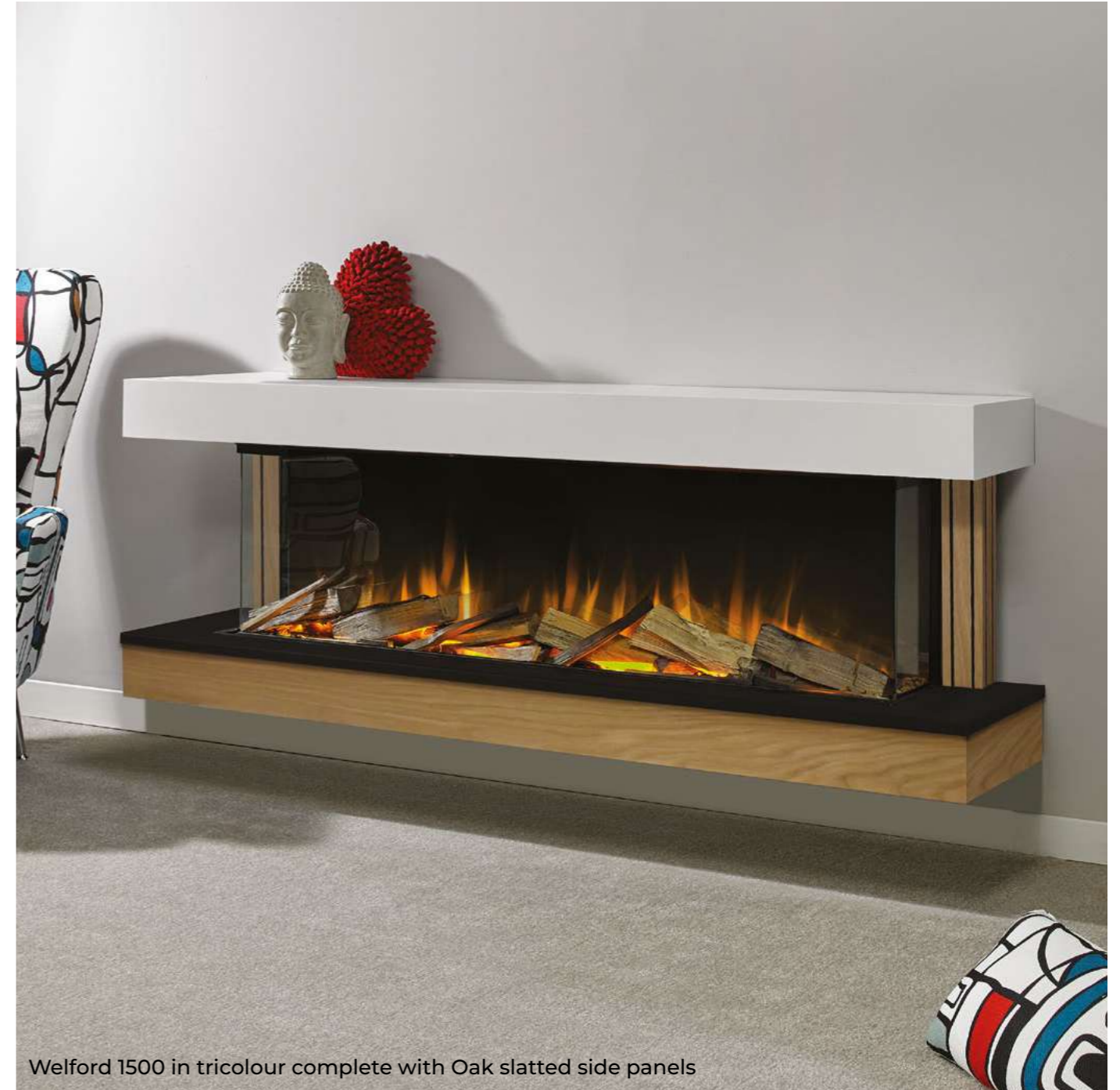
Welford 1500 in tricolour complete with Oak slatted side panels