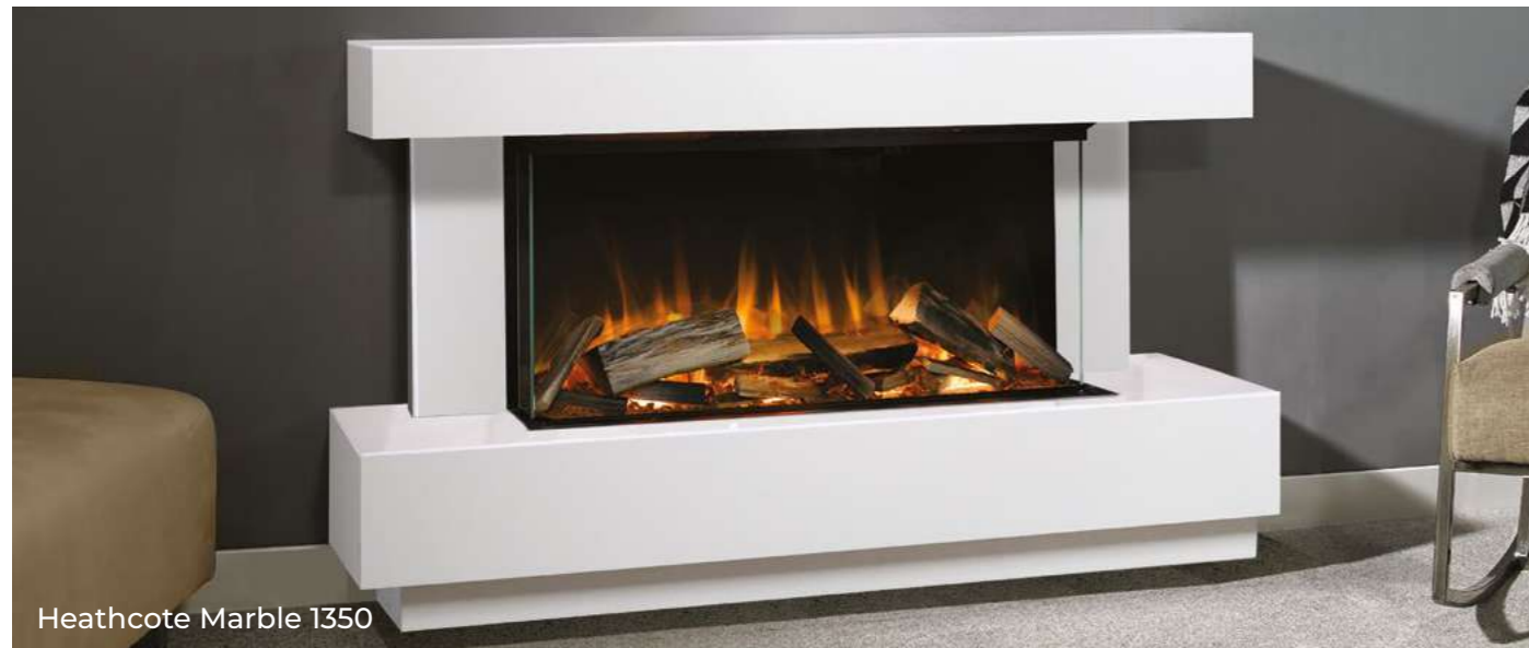
Heathcote Marble 1350