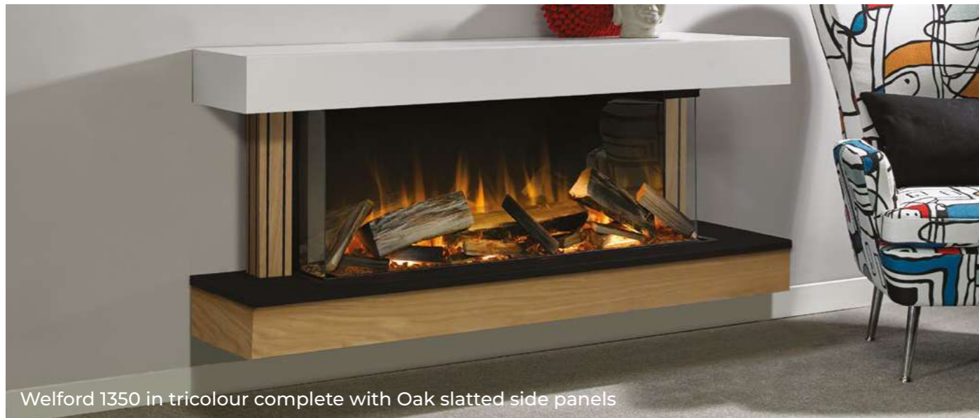
Welford 1350 in tricolour complete with Oak slatted side panels