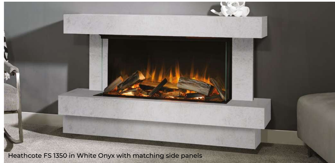
Heathcote FS 1350 in White Onyx with matching side panels