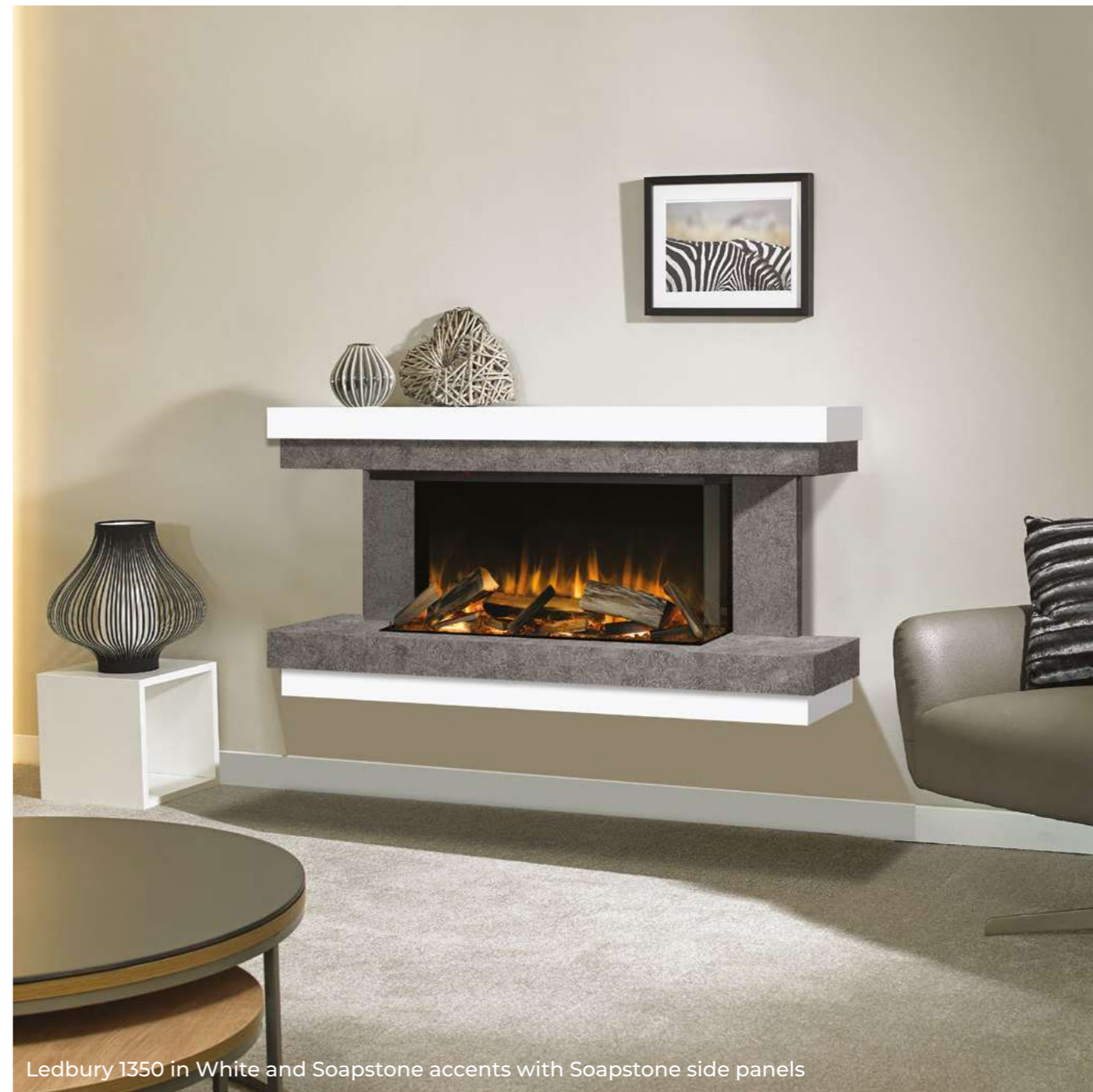
Ledbury 1350 in White and Soapstone accents with Soapstone side panels