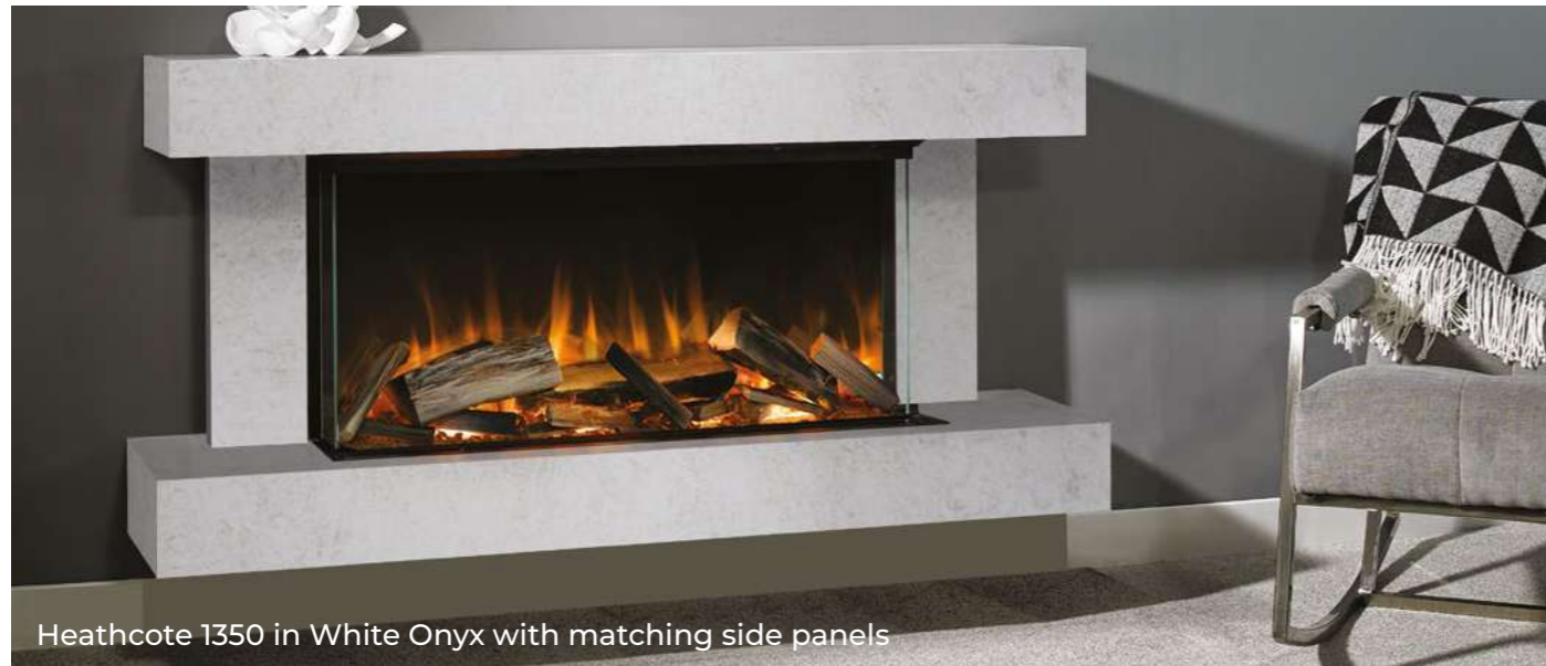
Heathcote 1350 in White Onyx with matching side panels