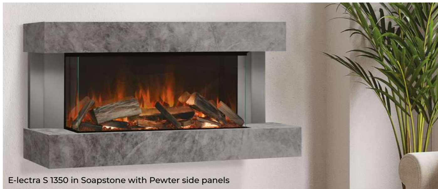
E-lectra S 1350 in Soapstone with Pewter side panels