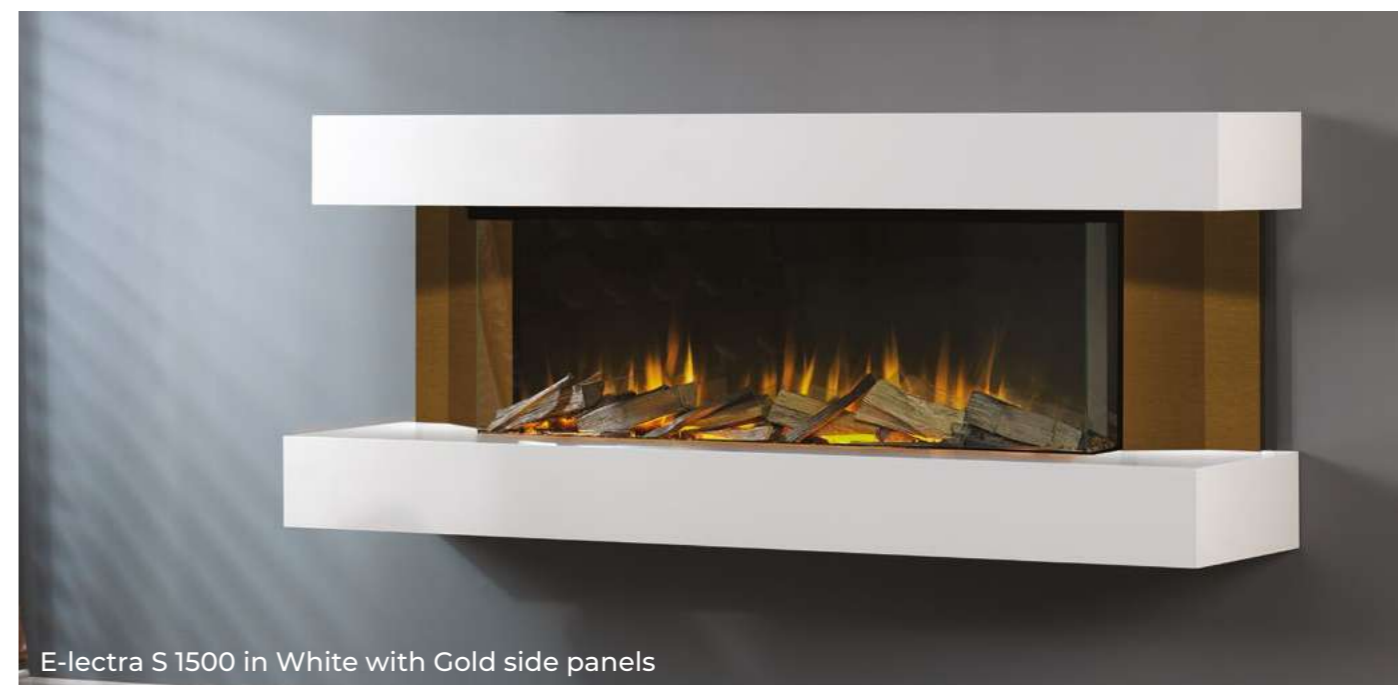
E-lectra S 1500 in White with Gold side panels