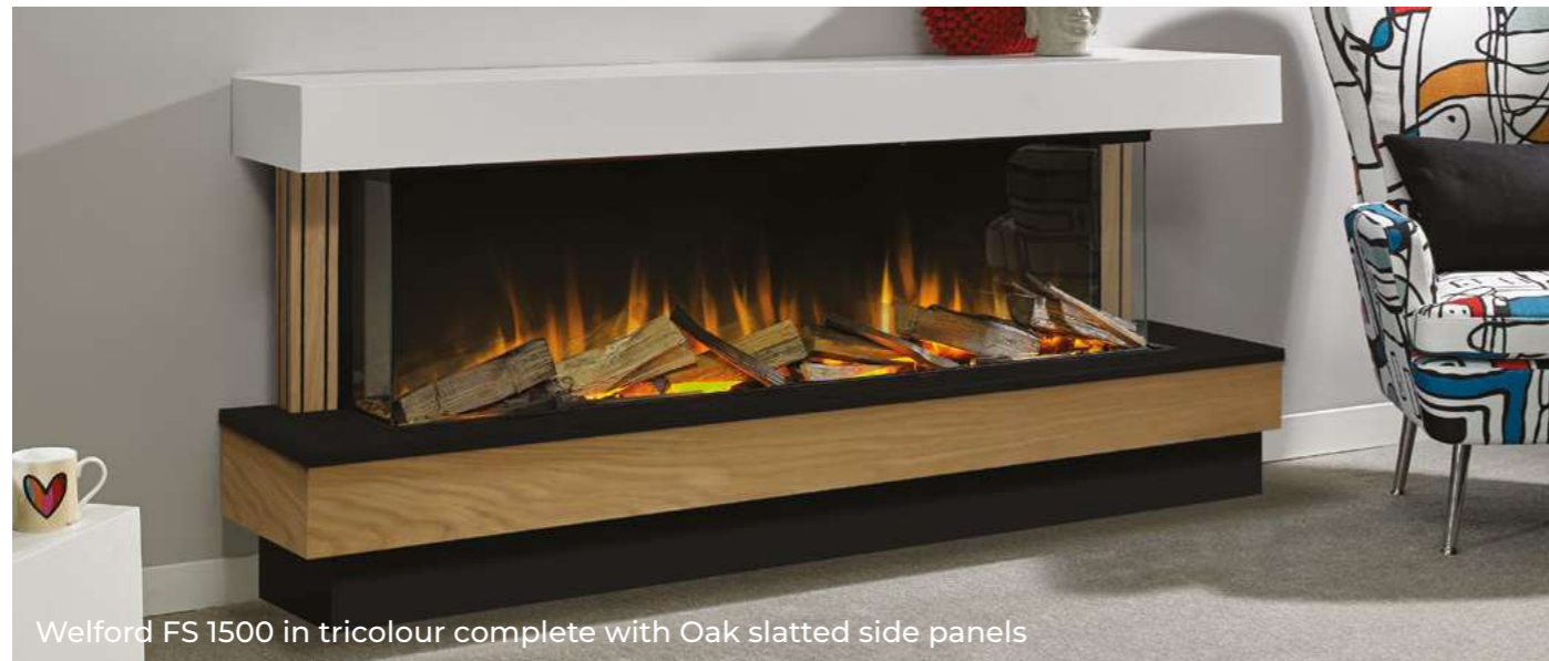
Welford FS 1500 in tricolour complete with Oak slatted side panels